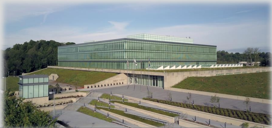
FBI CJIS Biometric Technology Center

The mission of the FBI CJIS Division is to equip our law enforcement, national security, and intelligence community partners with the criminal justice information they need to protect the United States while preserving civil liberties.