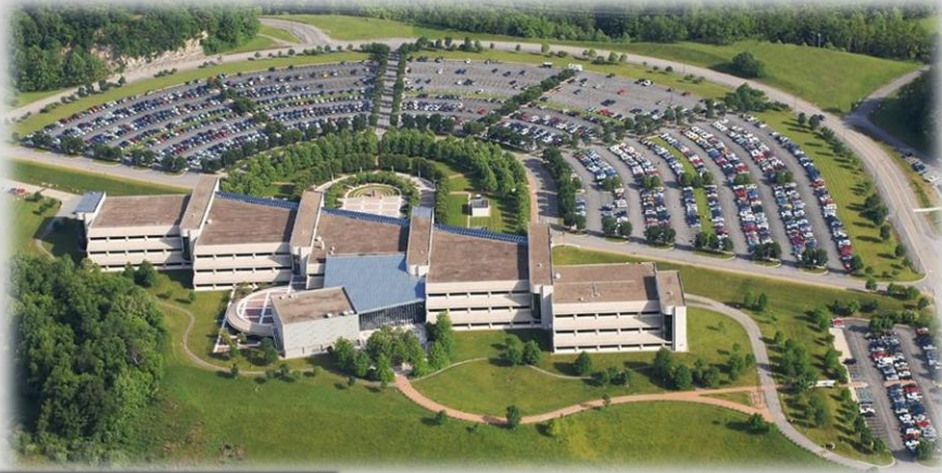
FBI CJIS Main